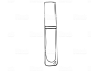
One tube Lip Balm