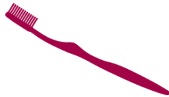
One toothbrush in the package