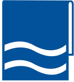
One cotton hand towel