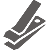
One fingernail or toenail clipper