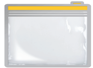
One Gallon Zip Lock Bags for packaging

Please bring donated items to the Church Community Center by March 24.