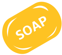
One bath sized bar of soap in the wrapper