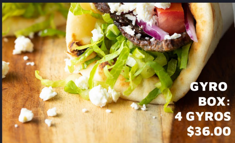
GYRO BOX: 4 GYROS $36.00