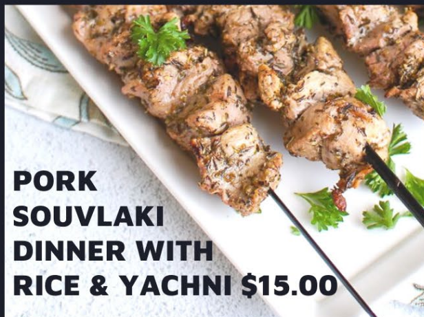
PORK SOUVLAKI DINNER WITH RICE & YACHNI $15.00