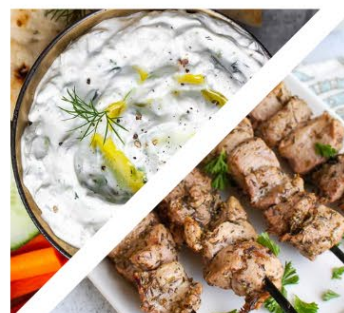
PASTITSIO, PORK SOUVLAKIA, PITA BREAD, TZATZIKI

VEGETARIAN PLATTER: 2 SPANAKOPITA, 2 TIROPITA, 4 DOLMATHES, 2 TZATZIKI, 2 PITA BREADS $25.00