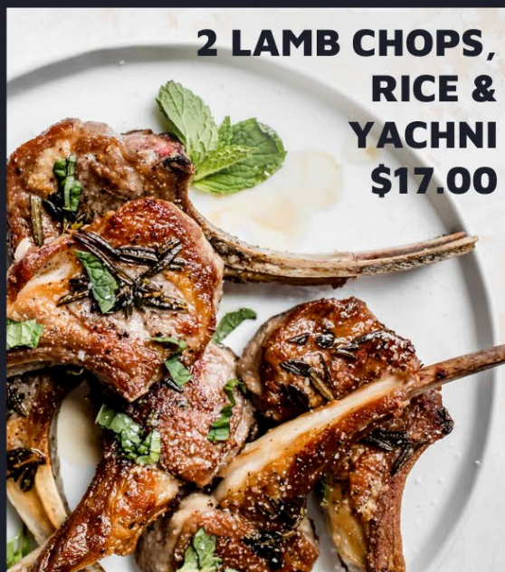
2 LAMB CHOPS, RICE & YACHNI $17.00

Dinner for Four: (4 of each) $50.00 Dinner for Two: (2 of each) $25.00