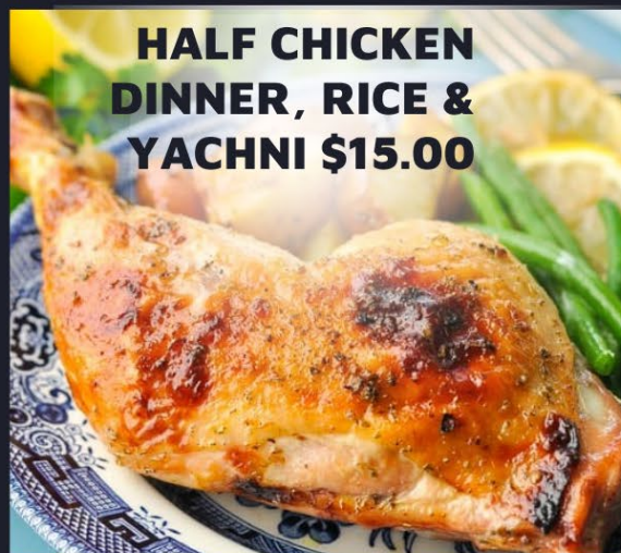
HALF CHICKEN DINNER, RICE & YACHNI $15.00