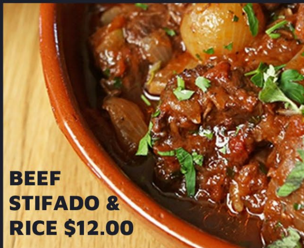
BEEF STIFADO & RICE $12.00

TIROPITA $5.00 SPANAKOPITA $5.00 RICE $3.00 GREEN BEANS YACHNI $3.00 DOLMATHES 4/$3.00 FRIES $3.00 GREEK FRIES $5.00