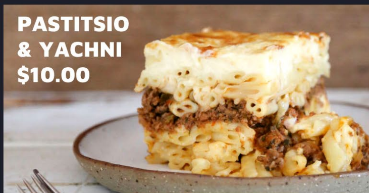
PASTITSIO & YACHNI $10.00

SOFT DRINKS, BEER, & OUZO AVAILABLE AT BAR TENT