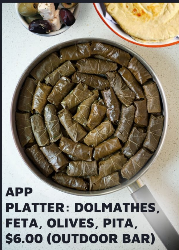
APP PLATTER: DOLMATHES, FETA, OLIVES, PITA, $6.00 (OUTDOOR BAR)

DIPLES $5.00 EACH FLOGERES 2/$5.00 ALMOND COOKIES 2/$5.00 BAKLAVA 2/$5.00 FINIKIA 2/$5.00 KOURAMBIETHES 3/$5.00 KOULOURAKIA 4/$3.00 LOUKOUMADES (4PM TO CLOSE, WALKUP ONLY AT TENT) 13/$8.00