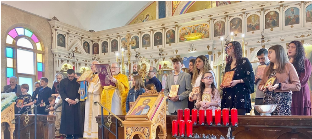
SUNDAY OF ORTHODOXY