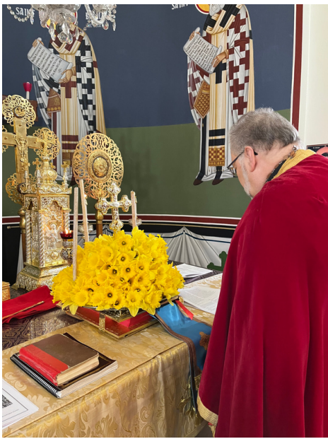
SUNDAY OF THE HOLY CROSS