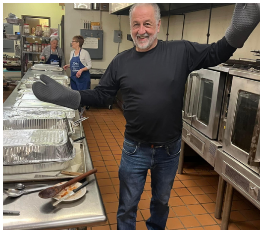
FOOD/CLOTHING/ HOT FOOD PANTRY