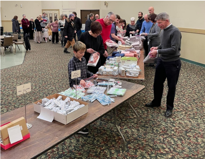
LENTEN SERVICE PROJECT - ASSEMBLING HYGIENE KITS FOR MCKEESPORT HOMELESS SHELTER