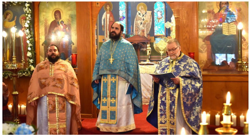
GREAT FEAST OF THE ANNUNCIATION & GREEK INDEPENDENCE DAY AT ANNUNCIATION GREEK ORTHODOX CHURCH IN WHITE OAK, PA