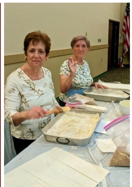
Four generations of Greek Pastry Bakers

Baking is officially underway for Greek Fest 2023!